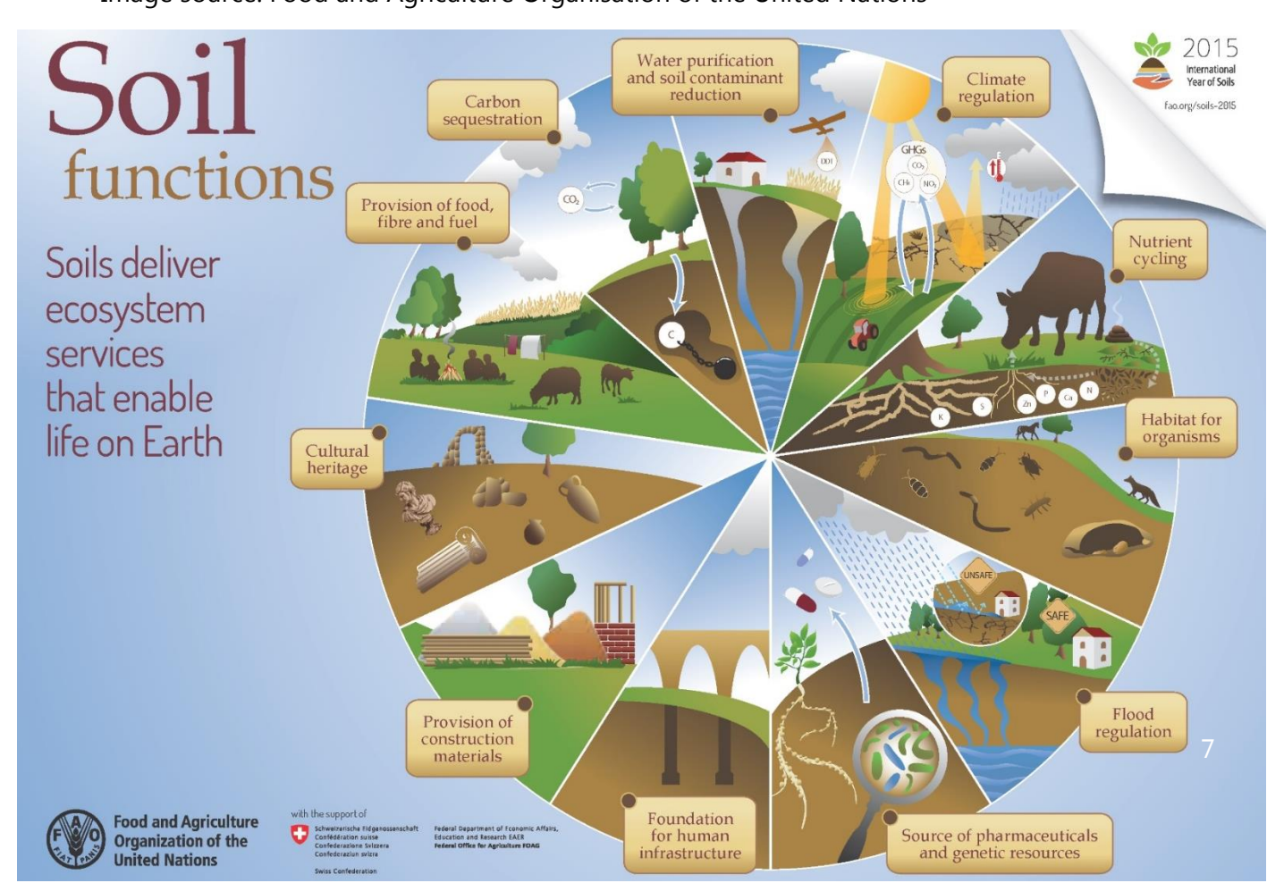
Image source: Food and Agriculture Organisation of the United Nations<sup>8</sup>